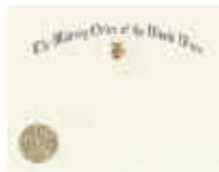
C1008 -Blank Certificate (H) (sample left)