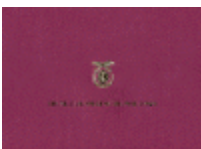
F1002 Maroon Folder (H) (sample left) and F1003 Maroon Folder (V)