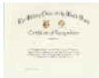
C1013 -GSA Certificate