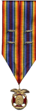
R1008 Neck Ribbon 2" – H1004 Hook – I1002 Insignia

Neck ribbons are authorized to be worn by the following National Officers with the appropriate accouterments. A neck ribbon order includes the ribbon, hook, and insignia.