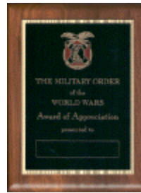
P1009 – Appreciation Award Plaque

Award of Merit Plaque. Given by chapters, states, departments, or regions to recognize an outstanding Companion who has given service above and beyond other Companions.