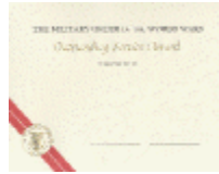
C1010 Outstanding Service Award Certificate

Outstanding Service Award , miniature medal, may be presented by any region, department, or chapter commander to a Companion only who has performed outstanding service to the Military Order of the World Wars for more than three years in one or more office(s) or position(s) to which they were elected or appointed. These include, but not limited to: vice commanders, adjutants, chaplain, marshal, historian, surgeon, and committee chairmen. The medal may not be awarded to chapter, state, department, or region commanders, national officers, or a member of the general staff, including Emeritus members, for service in these positions.