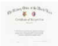
C1012 -BSA Certificate