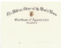
C1006 –Certificate of Appreciation