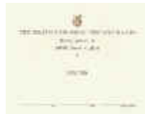
C1014JR JROTC Citation and C1014SR SROTC Citation

JR/SR ROTC Ribbon Bar can be ordered separately.