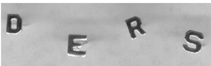
L1007D -Department Commander, L1008E -Emeritus, L1011R -Region Commander, L1012S -National Officer