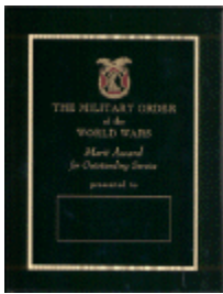
P1010 Merit Award Plaque