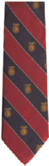
T1001 MOWW Necktie