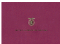
F1002 Maroon Presentation Horizontal Folder – F1003 Vertical Folder

Remember to order the appropriate number of citations and folders.