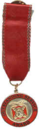
M1015 Outstanding Service Award Medal