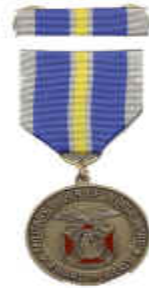
M1007SR(G) Award of Merit SROTC (Gold)

NOTE: All MOWW JR/SR ROTC Awards above come in a set that includes ribbon bar and medal.