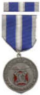
M1008SR(S) Award of Merit SROTC (Silver)