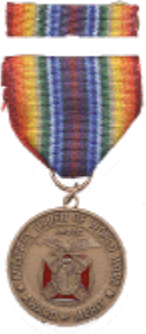
M1005JR Award of Merit JROTC