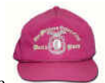
C1001 MOWW Cap