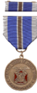
M1006SR(B) Award of Merit SROTC (Bronze)